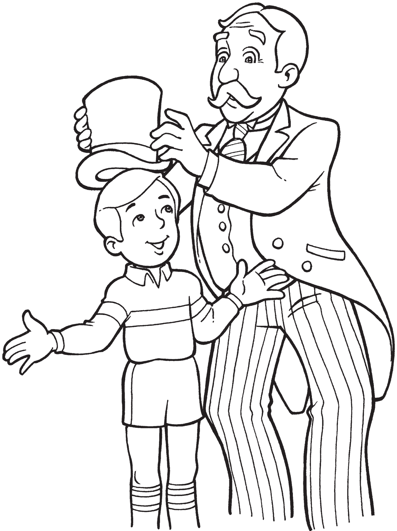
Davy Becomes Mayor for a Day