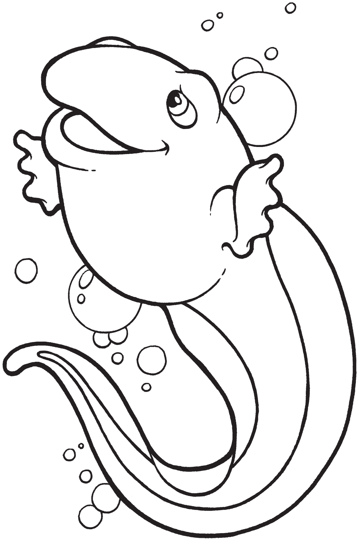
King of the Pond